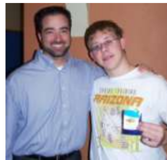
Colleyville Office Winner